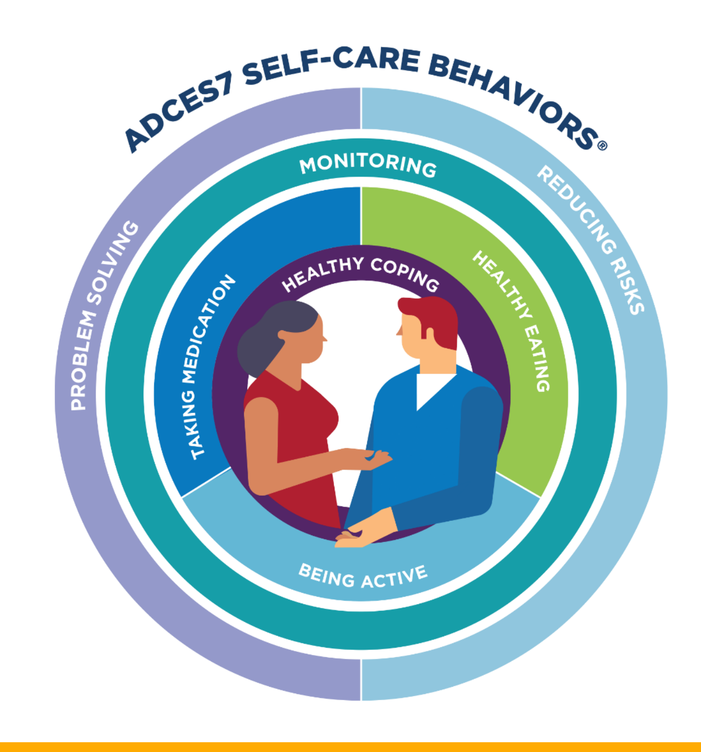
Figure 1: ADCES7 Self-Care Behaviors©

Diabetes is primarily a self-managed condition requiring individuals to perform and track multiple daily tasks as outlined in the Association of Diabetes Care and Education Specialists' self-care behaviors framework, the ADCES7 Self-Care Behaviors®1 (Figure 1). Diabetes self-management is challenging with only about half of those diagnosed meeting American Diabetes Association (ADA) treatment targets²,³. Unique physical characteristics, emotional concerns and environmental circumstances impact an individual's ability and willingness to self-manage their condition⁴. Digital innovations can help to individualize care to best match the lifestyle needs and circumstances of each person supporting them as they live their daily lives with diabetes⁵. Digital health can also provide actionable data for the care team giving them a window into the person's self-management journey and insights to optimize the care plan on a timely basis.